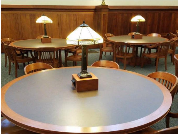
Friends of the Franklin Library purchased new tables and chairs for the library's main reading gallery.

We are an all-volunteer, nonprofit organization incorporated in 1992, dedicated to supporting and promoting the Franklin Public Library. We meet monthly, typically on the first Wednesday of the month. We invite you to join us and learn more!